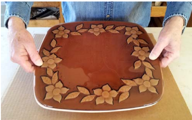
Glass on mold ready to load in kiln

After the glass is slumped, the fiber paper pieces can be easily removed. Scrub out any residue with a soft bristle brush.