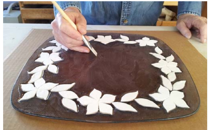
Brushing off the residue from shelf paper

will often carbonize and leave black smears on the glass. If the glass is slumped without the fiber paper left in, the weight of the glass will press down and remove much of the embossed pattern. Leave all the fiber paper in. Place the embossed glass in the mold and fire to slump. A handy way to get the glass onto the slumping mold without dropping out the fiber paper is to place the mold upside down over the glass and while holding the glass against the mold, flip it over.