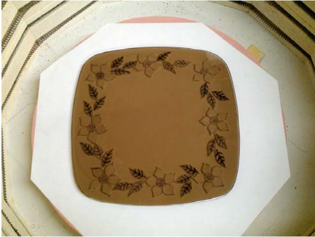
Glass on top of fiber paper ready to fire