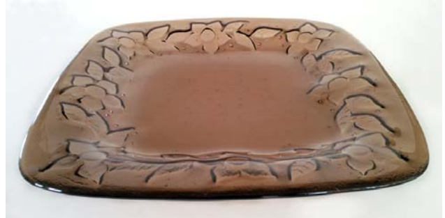
Finished embossed tray

After the glass is slumped, the fiber paper pieces can be easily removed. Scrub out any residue with a soft bristle brush.