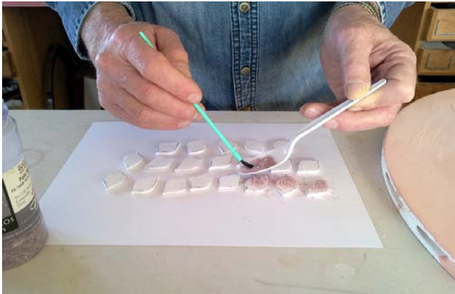
Applying frit to flower petals

Sprinkle frit onto the cut out pieces of fiber paper. Brushing the frit off a spoon is an easy way to control how much you distribute. If you work on a piece of paper, you can fold it up after to use as a scoop to return to the frit container any frit that spills off the fiber paper pieces.