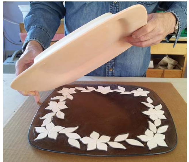
Placing slump mold over embossed glass