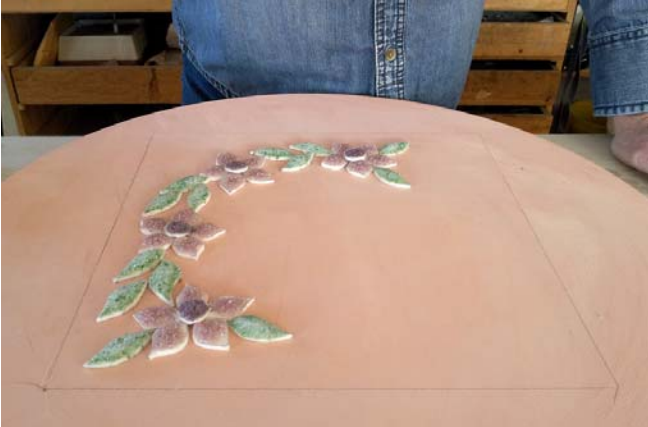
Finished pattern ready to load in kiln