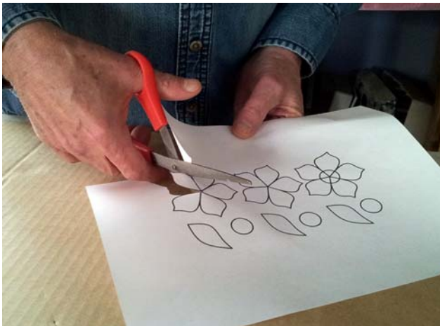
Cutting out the paper templates

Patterns for these flowers and leaves can be downloaded from the patterns section of the Glass Campus website.