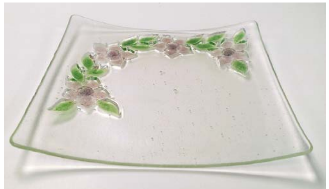
Finished embossed tray