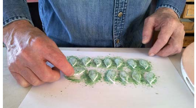
Laying out frit covered leaves