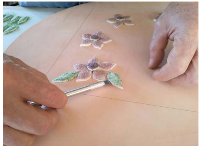
Placing frit-covered fiber paper pieces on kiln shelf

Sliding the blade of a box cutter or stencil knife under the fiber paper pieces is an easy way to pick them up and transfer them to the kiln shelf to lay out the pattern. Work in slow motion as you move the pieces around to experiment with different design layouts to avoid spilling the frit off the fiber paper. When you have finished your layout, brush away any bits of frit that jumped off the fiber paper.