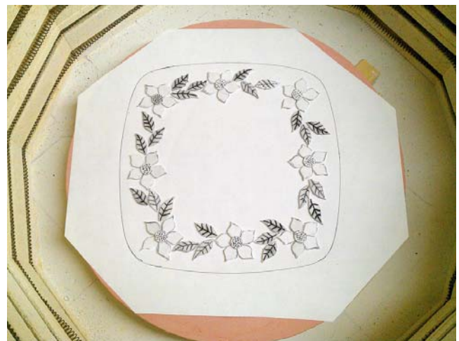
Fiber paper pieces set out in kiln

Slide the kiln paper onto a kiln shelf and place the kiln shelf in your kiln. Place two layers of glass on top of the cut-out pieces of ceramic fiber paper. For this project, a layer of 1/8" (3mm) thick clear was placed on top of a 1/8" (3mm) thick layer of transparent light bronze. You can use darker colors but lighter colors show off the embossing better than darker colors. Opal colors will show the embossing only on one side. Iridescent or dichroic glass doesn't work very well for embossing. The metallic coating resists imprinting and will only emboss a small depth.