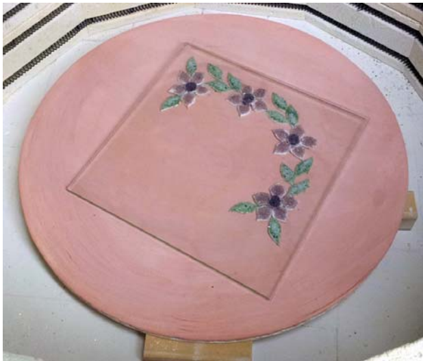
In kiln ready to fire