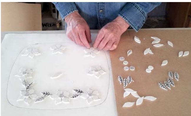
Laying out the fiber pieces on kiln paper

With a soft pencil, trace the mold you plan to use for slumping onto kiln paper or directly onto your kiln shelf. Position the cut out pieces of fiber paper on the kiln paper or kiln shelf to lay out your design. This is a good time to experiment by moving the pieces around to try different design configurations.