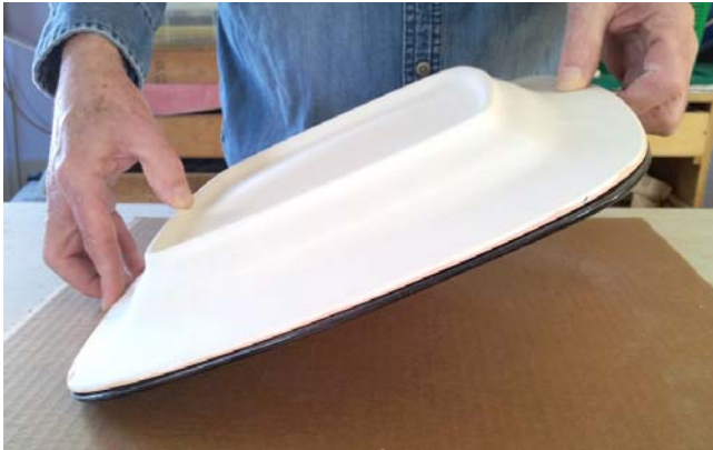
Flipping the mold