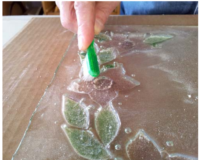
Brushing off fiber paper residue

If you prefer to slump with the embossed texture facing up, carefully brush out all fiber paper residue before firing. The rough sandpaper-like texture from the fused-on frit will slightly soften in the firing.