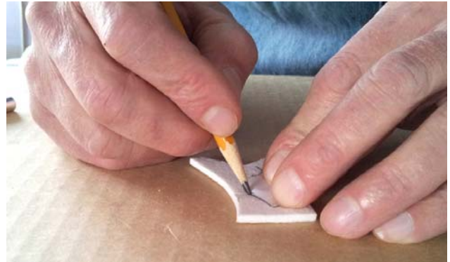
Drawing the pattern onto the fiber paper